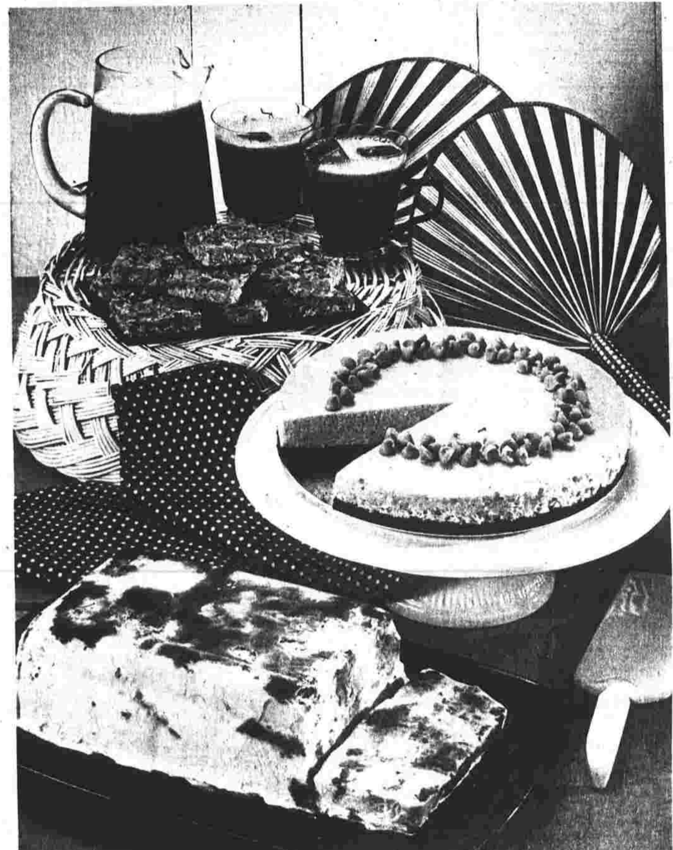
FESTIVE FOOD for the Fourth, easily made in advance, includes Cranberry Ripple Ice Cream, Creamy Peanut Butter Cheesecake, Peanuty Oat Bars and Old Glory Grapefruit Drink. They'll give you a good reason to celebrate!

Hot weather and cool beverages go hand in hand. Old Glory Grapefruit Drink is a refreshing cooler combining the wonderful flavor of bottled grapefruit juice with thawed, frozen raspberries and a taste of honey. Whirl the mixture in a blender and serve at once, or pour it into a thermos and shake it up for picnickers later!