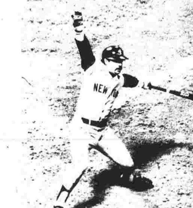
Reggie Jackson of the New York Yankees almost falls down after taking hard swing in eighth inning in game last night at Fenway Park. Jackson connected for third inning homer which won it for Yanks.