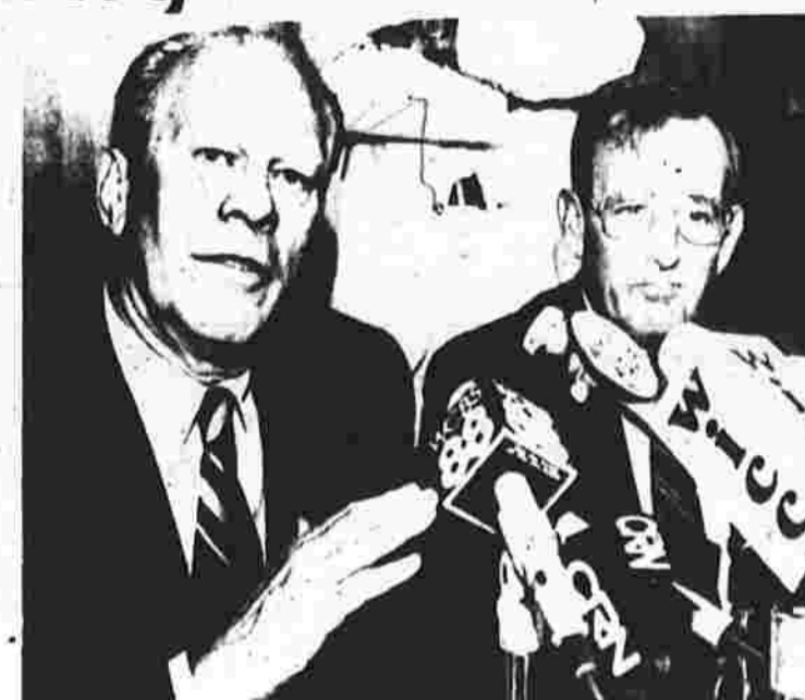
Ford raps Carter

Former President Gerald R. Ford at a news conference in Stamford Tuesday, said the Carter administration's policies at home and abroad are a "disaster" that can put Ronald Reagan in the White House.