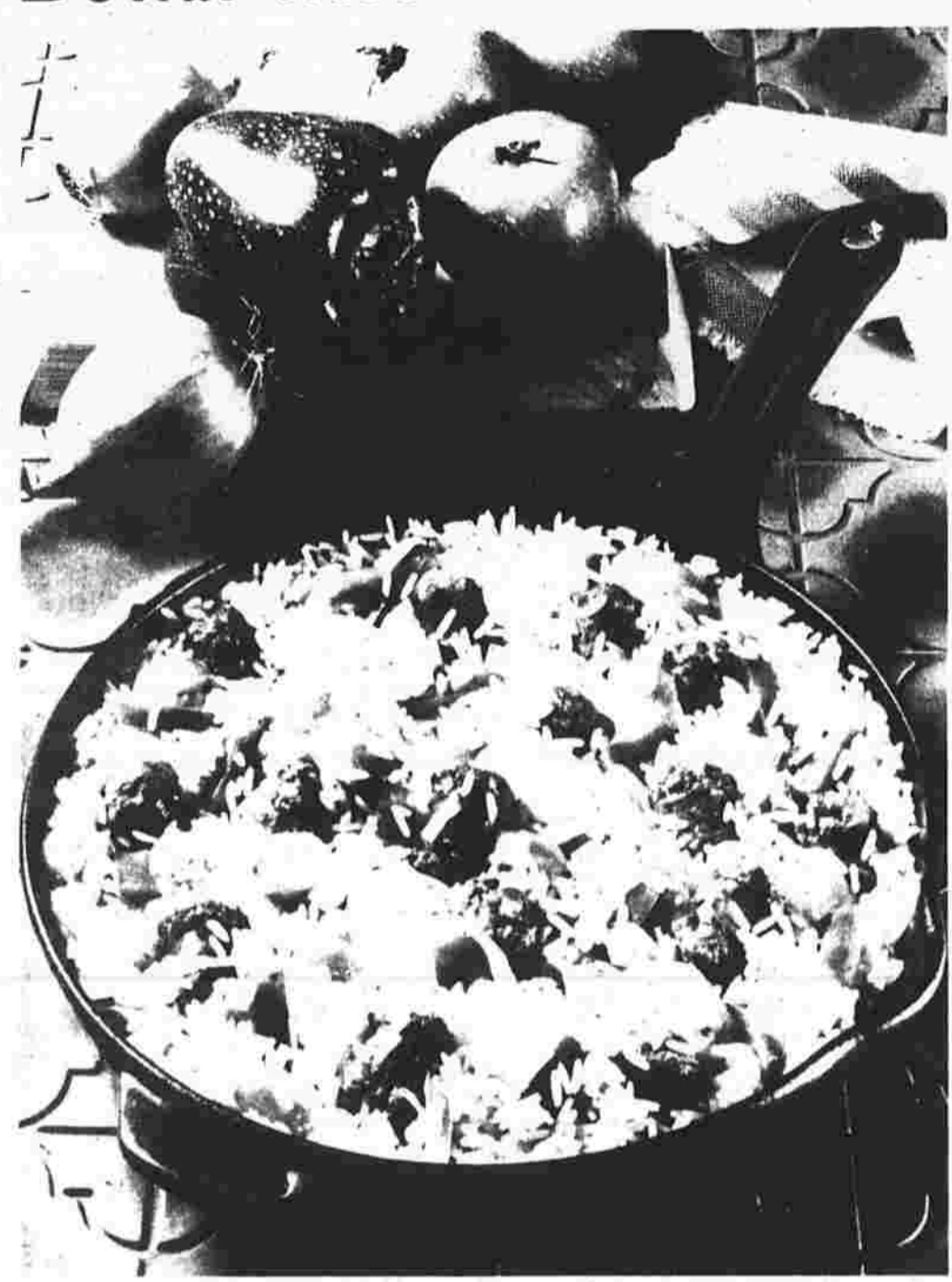
For a gourmet-quality meal on a shoestring, serve Mediterranean Pepper Skillet. The cook and the kitchen keep cool as the one-dish meal simmers unwatched.

Food dollar stretching and energy conservation have become a way of life for most Americans. One great way to conserve food dollars, energy (both fuel-energy and personal physical energy) and time spent in meal preparation is to serve satisfying skillet rice dinners. As the skillet simmers unwatched, toss a salad, set the table, sit down and relax. All the cooking is done in one skillet, keeping the cook and the kitchen cool, saving fuel and reducing after-meal clean-up.